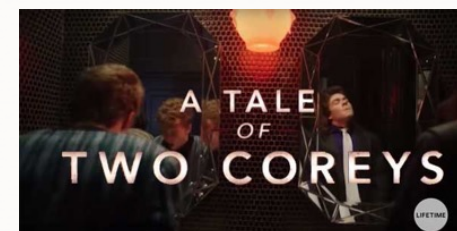
Lifetime Television's "A Tale of Two Coreys"